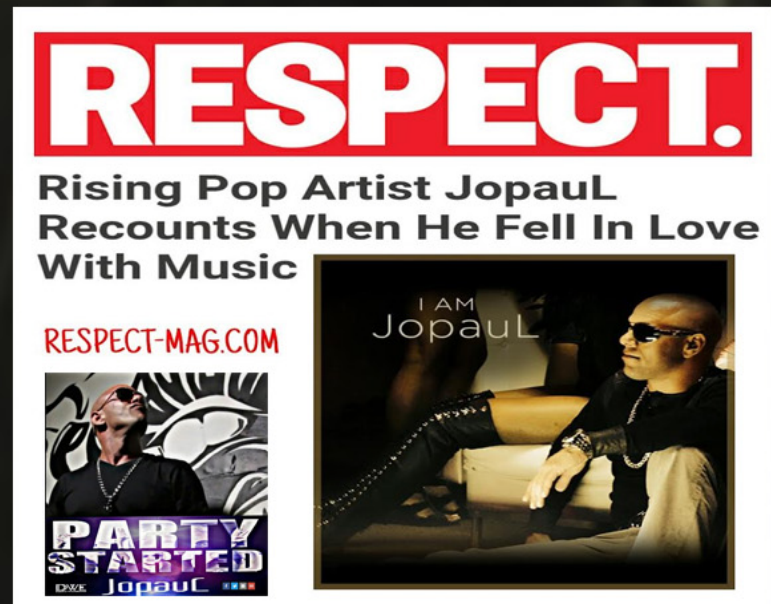
respect-mag.com (20 June 2016)