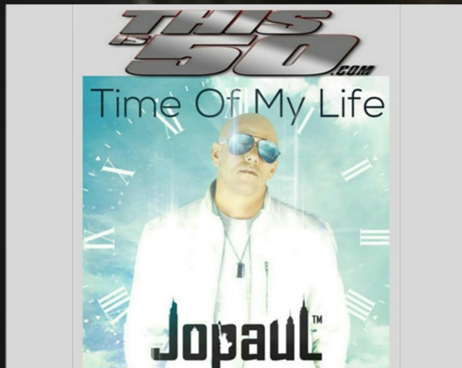
thisis50.com (15 June 2016)