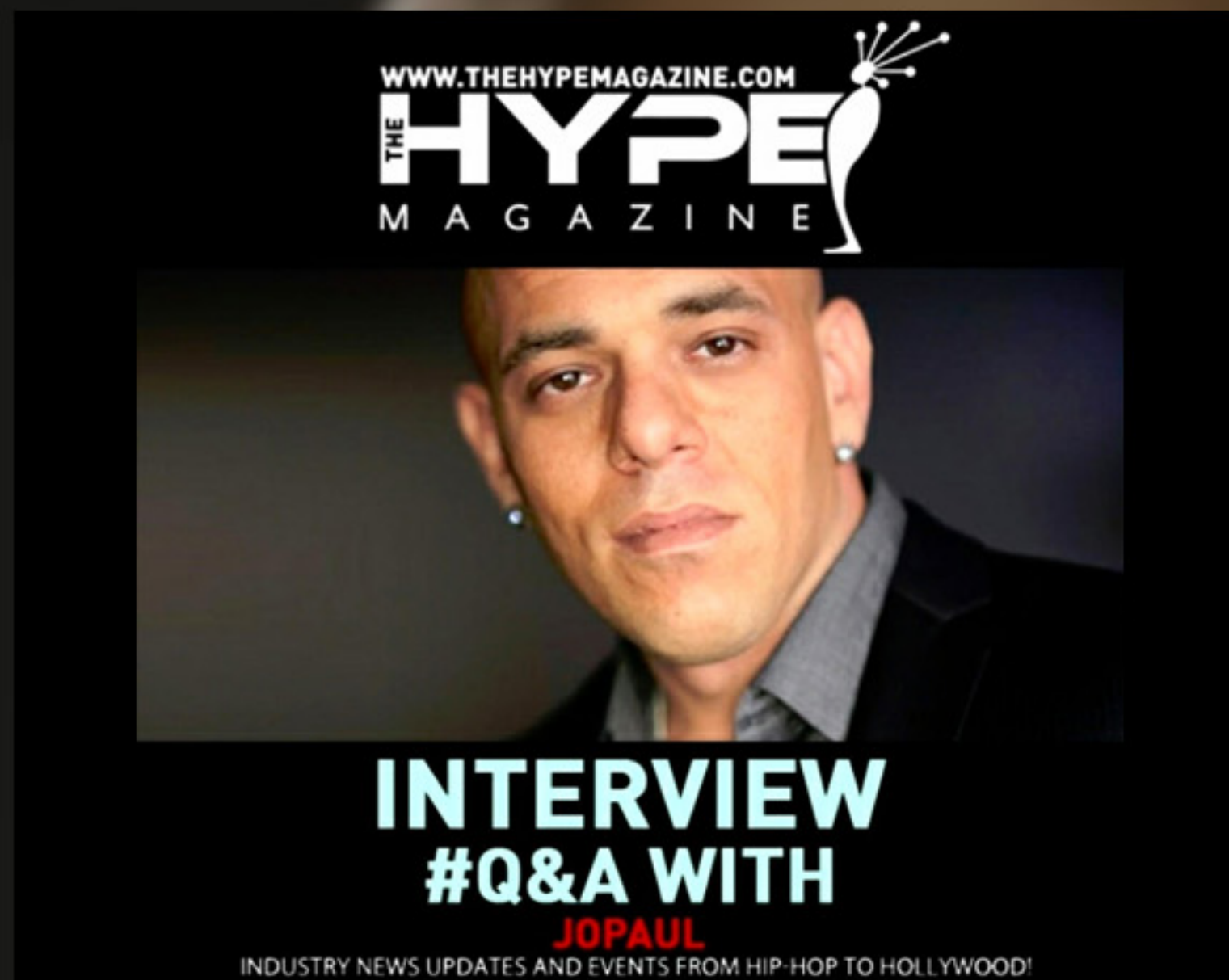
Hype Magazine (12 June 2016)