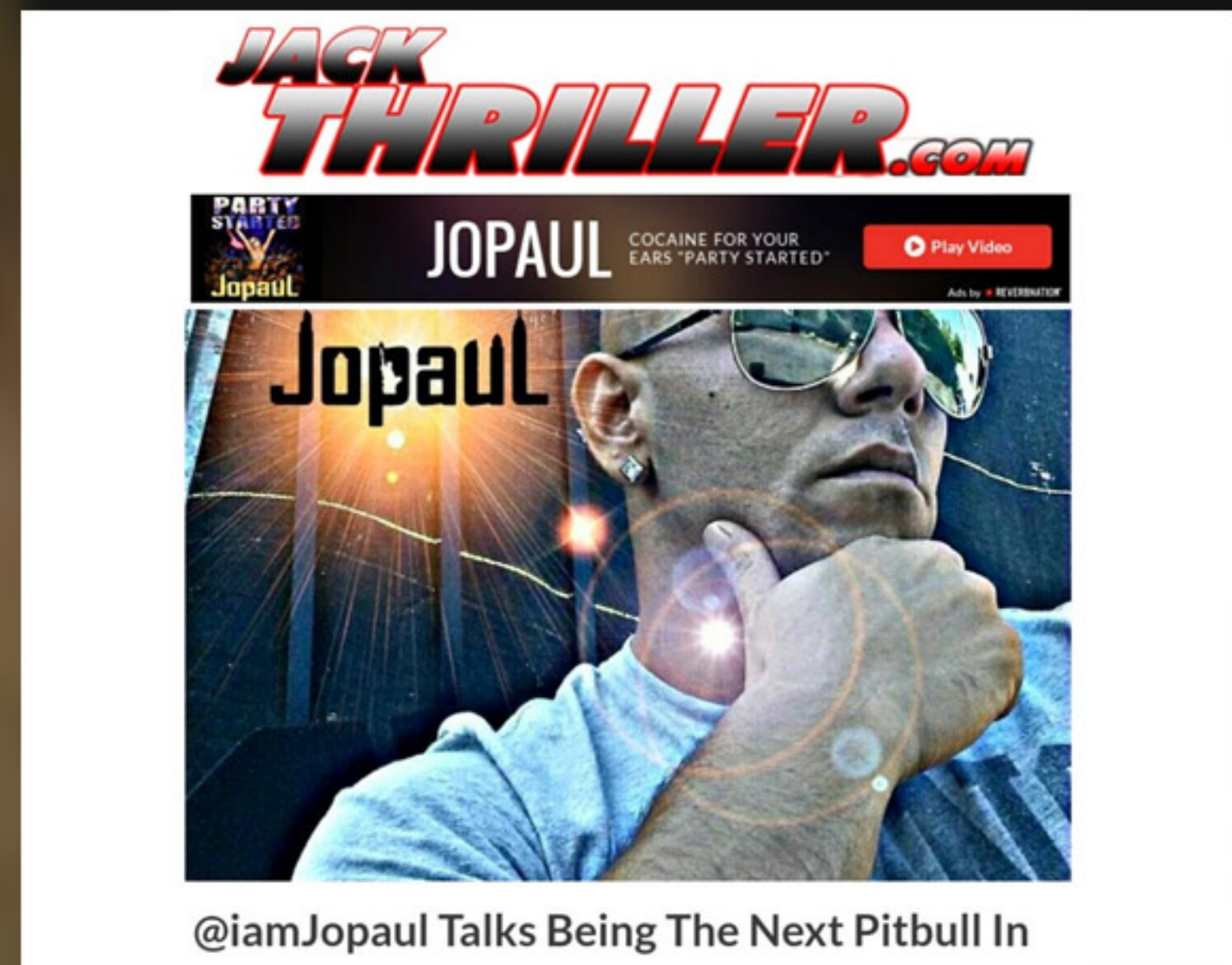
jackthriller.com (15 June 2016)