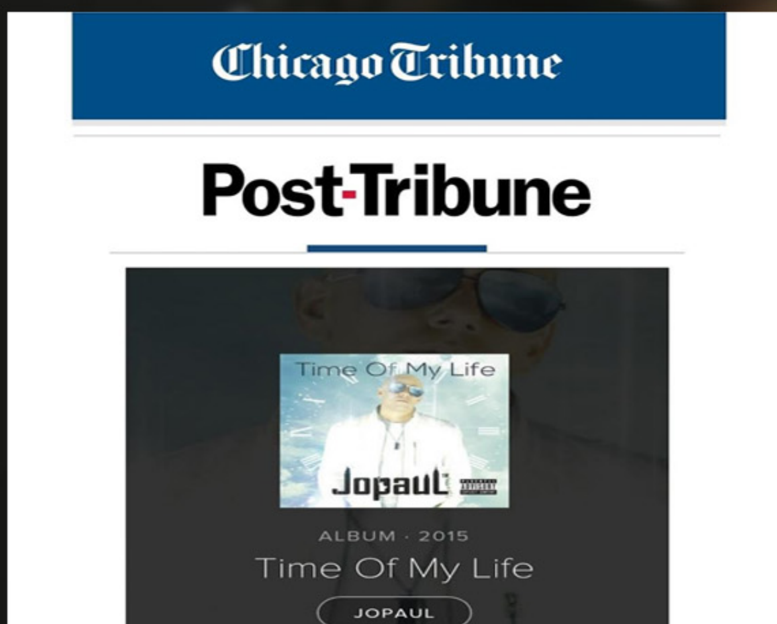
Chicago Tribune (1 January 2016)