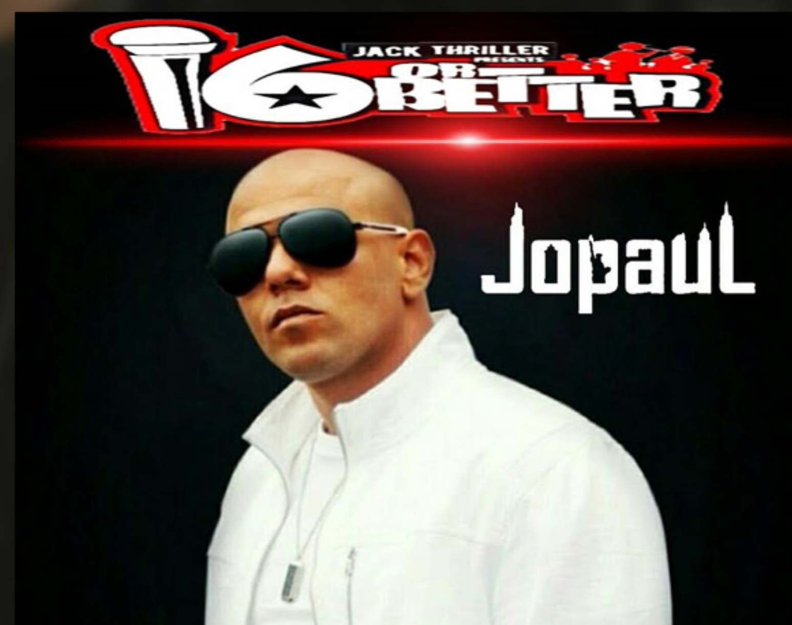
16 or Better (7 July 2016)